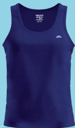
Chest Measurement Chart