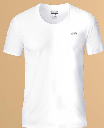
Chest Measurement Chart